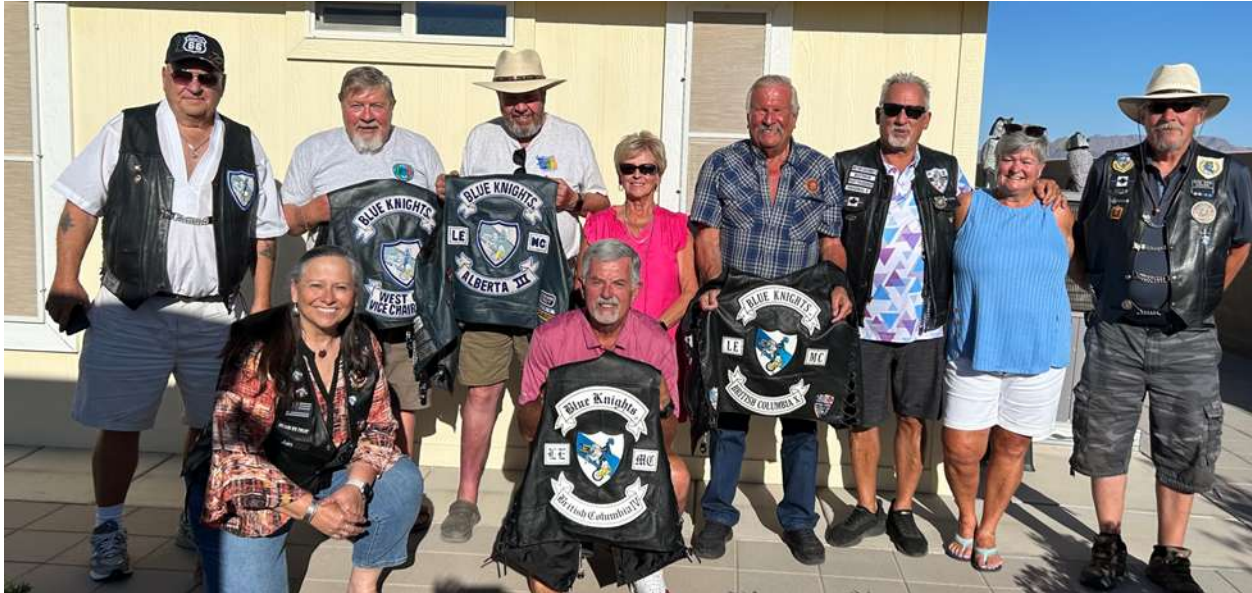
A Yuma gathering of WCC Knights