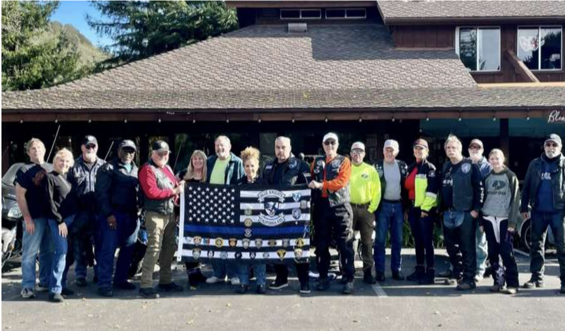
CA XXII Ride to Lake Havasu